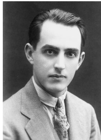
Júlio César de Mello e Souza