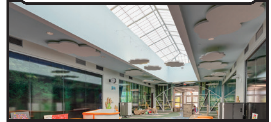
Example of Proposed Daylighting

Playground Equipment - Install new or additional playground equipment at every elementary school, with a theme focused on imaginative play and learning, on handicapped-accessible, poured-in-place rubber surfaces instead of mulch. Each school's playground would have a theme unique to the campus. The district intends to publish a map of themed playgrounds for the community's use outside of school hours. Bond 2022 would fund the majority of playgrounds. Other funding sources that will be used include federal (ESSER), City of Houston (TIRZ), and District (savings).