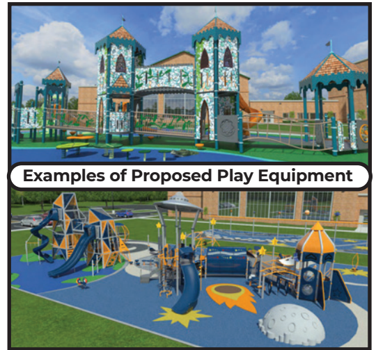
Examples of Proposed Play Equipment