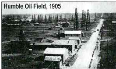
Humble Oil Field, 1905

In February 1919, the Texas Legislature transformed Harris County Common School District 50 into the Humble Independent School District. This act created a locally-governed system of schools, with an elected Board of Trustees, which was not under the control of the Harris County Department of Education.