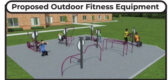
Proposed Outdoor Fitness Equipment