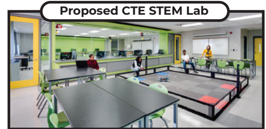
Proposed CTE STEM Lab

Second Gym - Add a second practice gym to accommodate current and anticipated student needs.