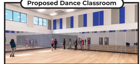
Proposed Dance Classroom